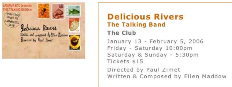
Figure 6: Delicious Rivers

(ix) Model building for everyone One of the most charming events, one that lasted almost the entirety of the conference, was the creation, in situ, of two colorful geometric constructions. In the words of Doris Schattschneider, "In the lobby outside the lecture hall, there were always a few children, participants, and spouses seated or kneeling on the floor, busy joining 3,720 ZomeTool connector balls to 10,680 struts in modules that each hour were added to two growing monster models, [3D] shadows of the 4D cantellated 600-cell. David Richter and Daniel Duddy orchestrated the project." One of the two models was donated by the ZomeTool people to BIRS where it has a permanent place in the Corbett Hall lounge.