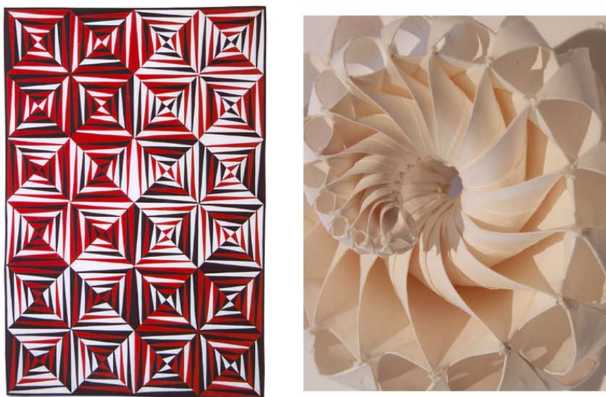
Figure 2: Quilt by Gerda de Vries; paper spiral by Bradford Hansen Smith