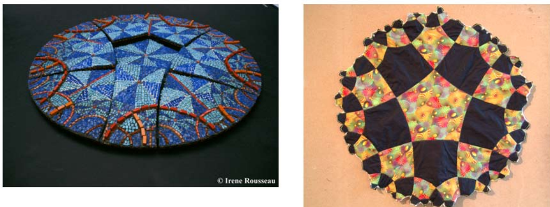
Figure 3: Two hyperbolic tessellations: Irene Rousseau and Mary Williams