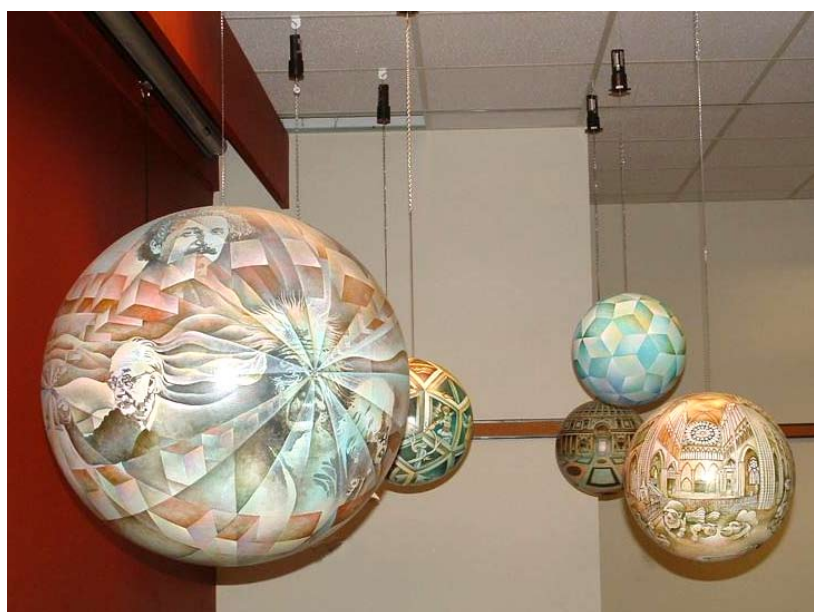
Figure 4: Some of Dick Termes' spheres