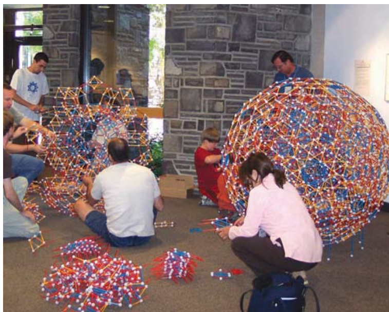
Figure 7: Community building of the 3D shadow of the cantellated 600-cell

around the world in a highly enjoyable, stimulating, and encouraging atmosphere of mutual exchange and appreciation. It had a public component (the art gallery, and the lecture on Coxeter) that drew a capacity crowd to the Max Bell auditorium. It sponsored an innovative new play that went on successfully to run as an off-Broadway production in January-February of 2006.