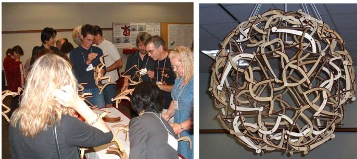
Figure 5: Work in Progress and Its Completion: a group affair led by George Hart

(vi) The Art-in-Progress Exhibit One of the more interesting features of Renaissance Banff was what one might call a show-and-tell room: a room set aside for displaying hands-on things and works in progress. Above all Renaissance Banff, like all Bridges Conferences, was a place for people who are actually doing something creative with the mathematics-arts connection to interact with others of the same breed. And what better way to do that than to have a special room for them to show their stuff and interact on a one-one basis! As an example we show here the group assembly in which many people participated to form a geometric sculpture, one meter in diameter, from 180 laser-cut wooden interlocking components.